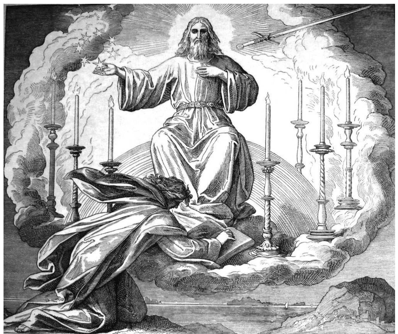
Illustration 1: Gustave Doré, The Vision of John on Patmos, http://upload.wikimedia.org/wikipedia/commons/8/8c/Zjeven%C3%AD_Janovo.JPG, PD

The book of Revelation is also known as the Apocalypse (Roman Catholic Bibles often prefer this title). "Revelation" comes from the Latin revelo , which refers to showing or making known something that has been hidden or not known. "Apocalypse" comes from the Greek \dot{\alpha}\pi\sigma\kappa\dot{\alpha}\lambda\nu\psi_{1S} ( apokalypsis ), which means to remove the cover or wrapping from something, or to bring something out in the open. In each case, the "something" has not been known before.