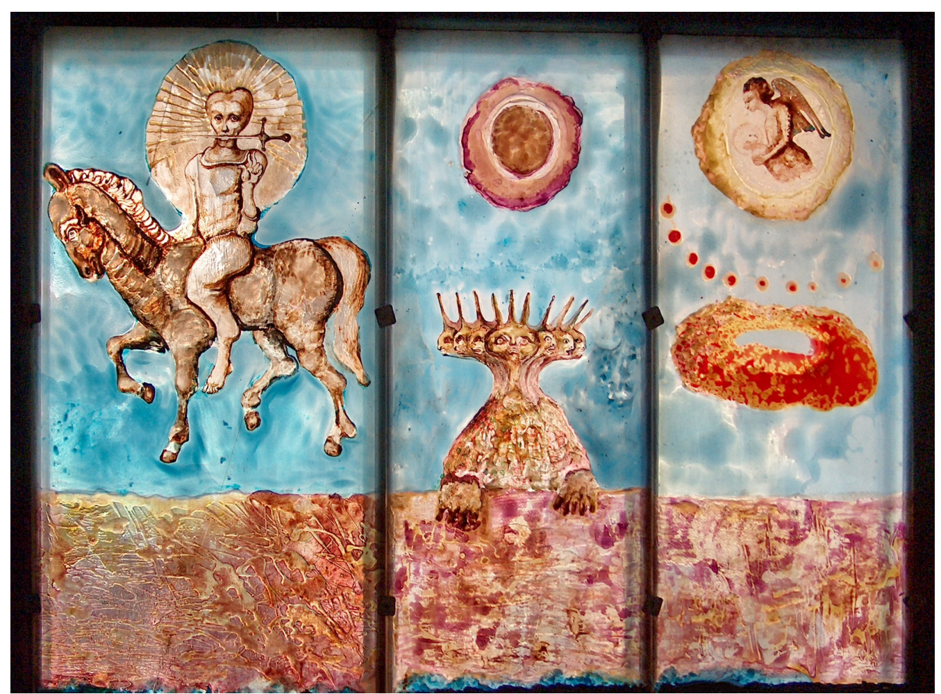
Illustration 4: Jan Lebenstein, stained glass in Pallottine chapel, Paris

Second, apocalypses generally use symbolic language. The images described with this language are usually bizarre. They often use mythological or symbolic elements. One of the purposes of this imagery is to obscure the meaning to "outsiders." This is often considered necessary by the writer because an apocalypse often delivers an uncomplimentary view of powerful people.