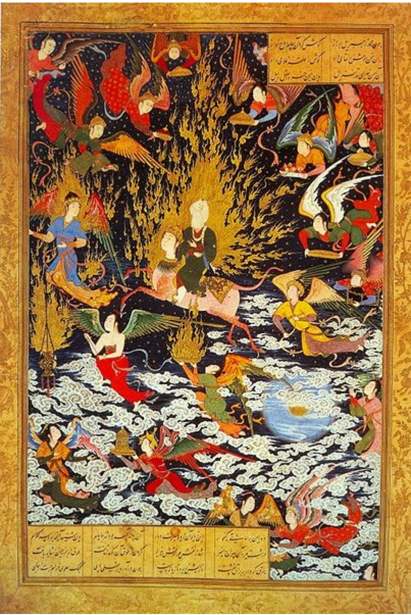
Illustration 3: Sultan Muhammad, Miraj, ca. 1539, http://www.mirror.org/greg.roberts/MirajB1.jpg, PD

Although John's is the first such work to call itself an apocalypse, many others followed, and many earlier works share its characteristics. The term "apocalyptic literature" is often used to refer to writings which share this viewpoint. The worldview which comes from devotion to the ideas of this literature is generally called "apocalypticism." Although there is no single feature that one could say is always shared by apocalyptic literature, some features stand out.